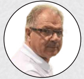
DR. MUSCAT, MALTA